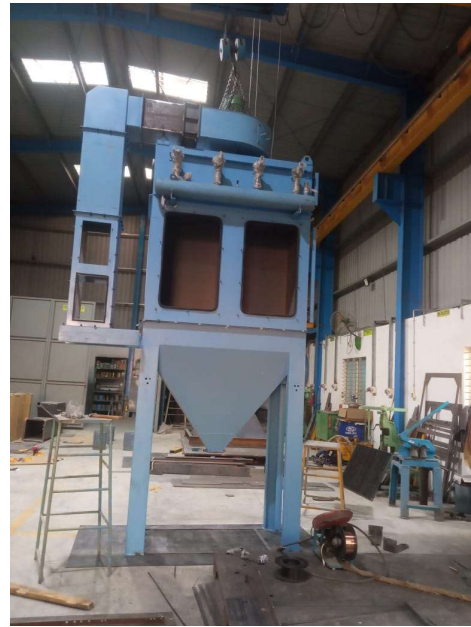
CARTRIDGE FILTER SYSTEMS