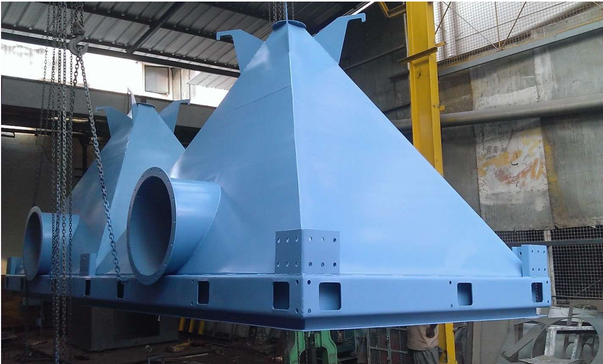
HOPPERS FOR DUST COLLECTORS