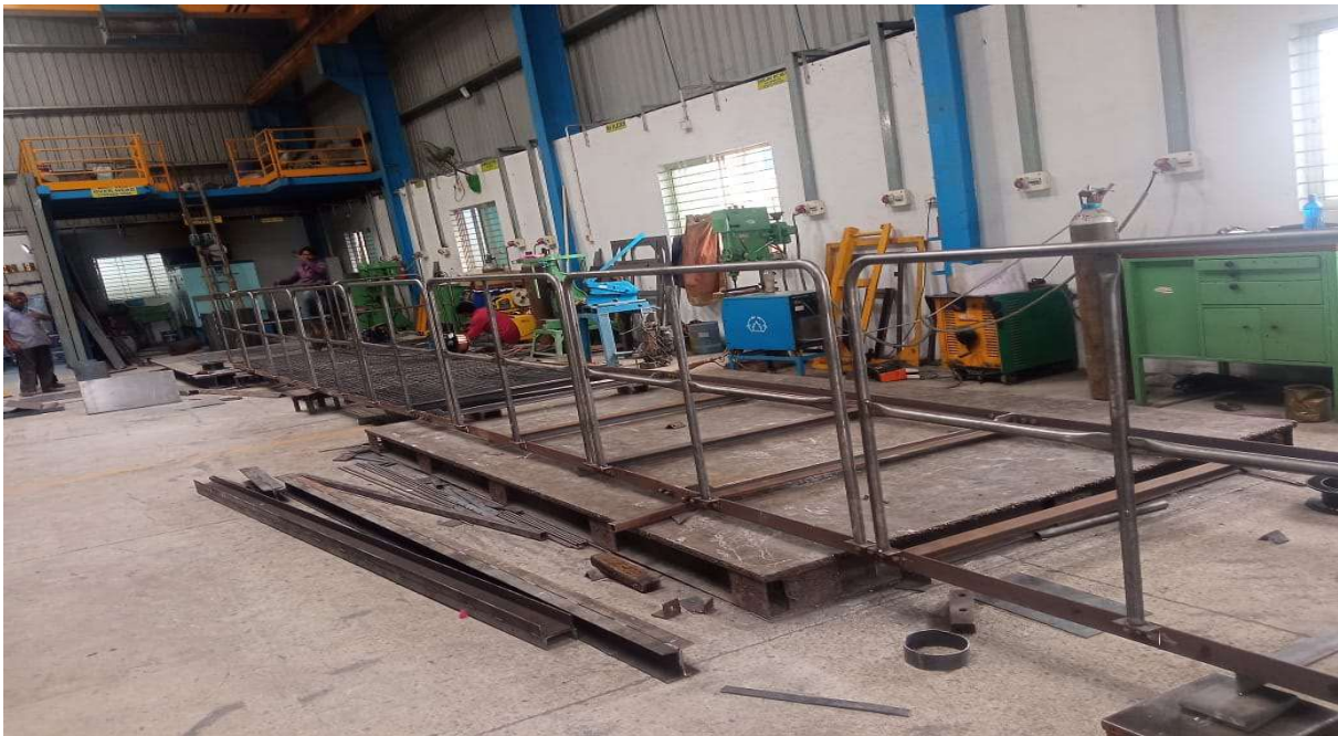
RAILINGS AND PLATFORM SYSTEMS FOR MACHINES