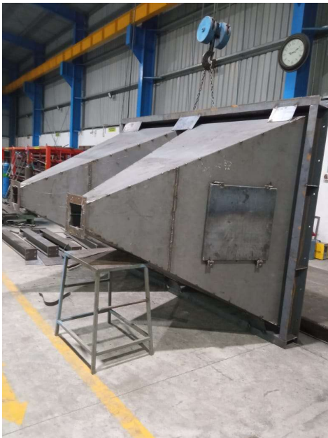
HOPPER DUST COLLECTORS