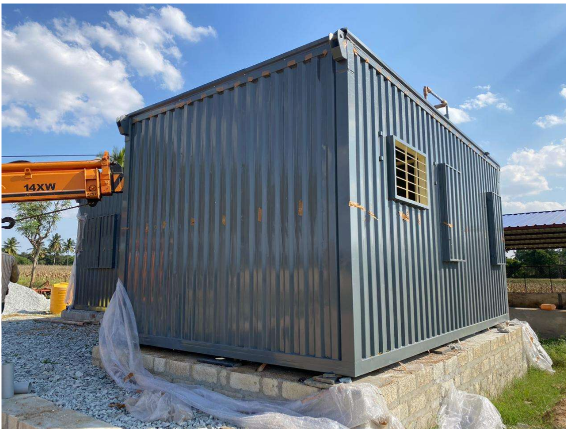
CONTAINER HOUSES / PODS