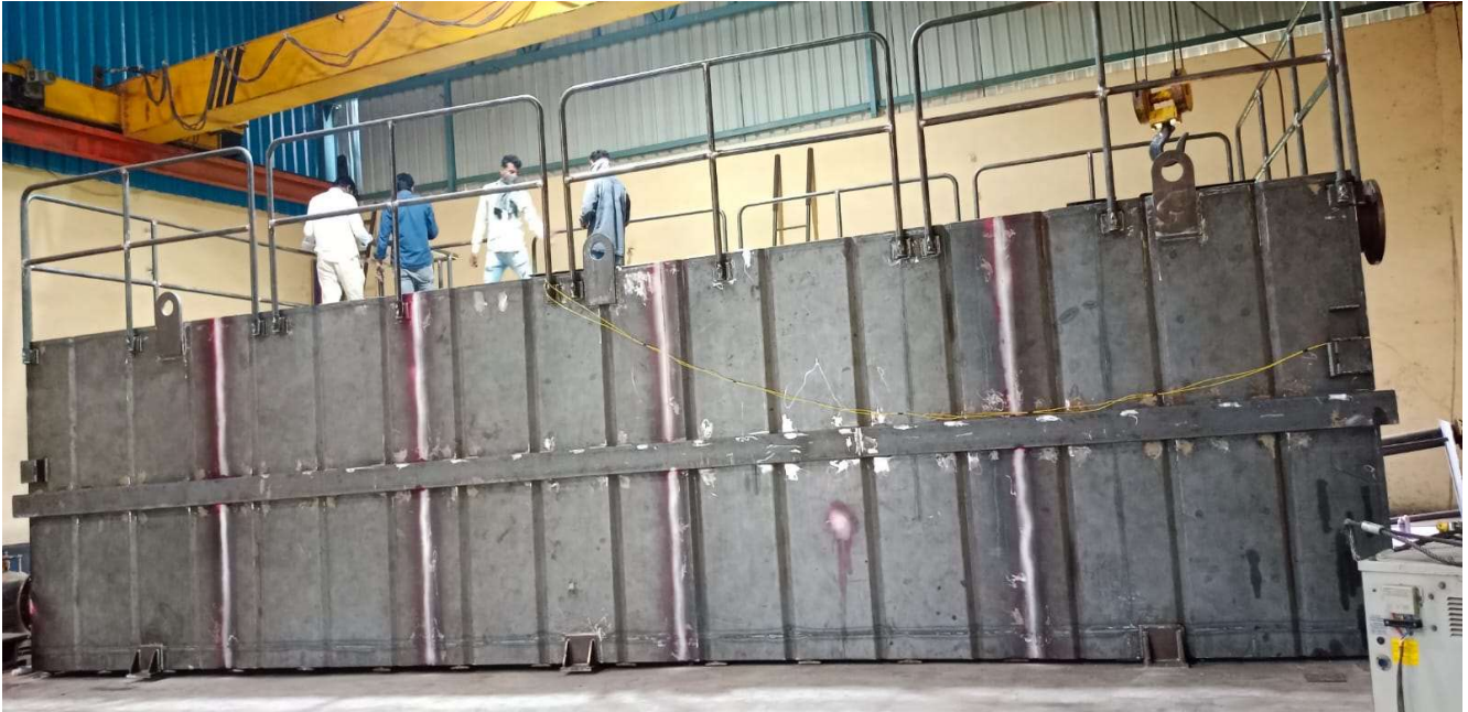
LUBRICATION OIL STORAGE TANKS - 60,000 Litres