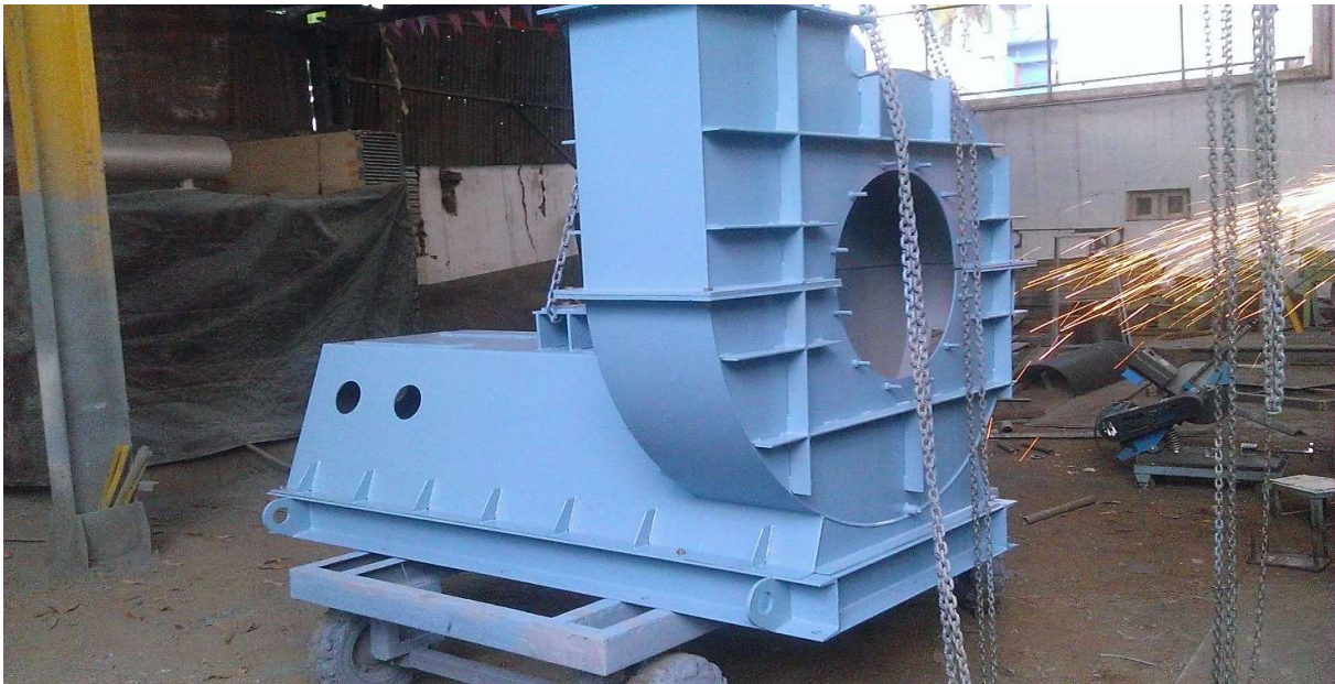
FAN CASINGS FOR INDUSTRIAL UNITS