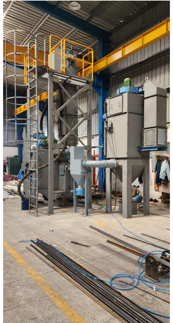
BB170 - SHOT BLASTING MACHINES